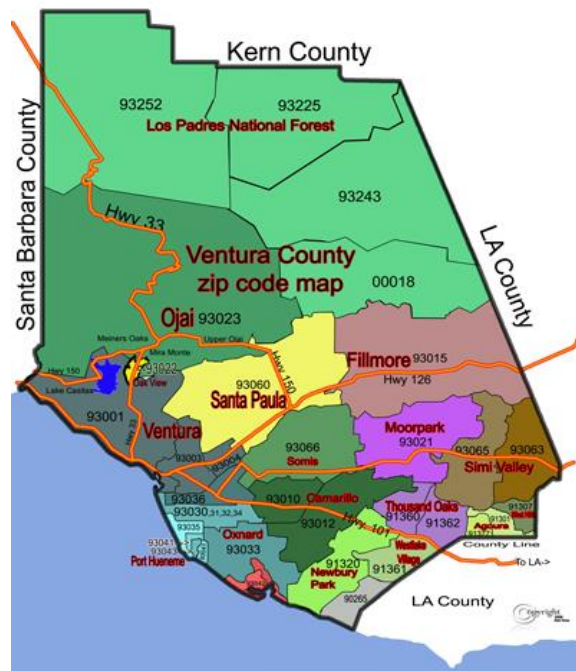
COMMUNITY RESOURCE ASSESMENT STUDY

Every city in Ventura County – Camarillo, Fillmore, Moorpark, Newbury Park, Oak Park, Ojai, Oxnard, Port Hueneme, Santa Paula, Simi Valley, Thousand Oaks, Ventura, and Westlake Village. Zip codes include: 91319, 91320, 91358, 91359, 91360, 91361, 91362, 91377, 93001, 93002, 93003, 93004, 93005, 93006, 93007, 93009, 93010, 93011, 93012, 93015, 93016, 93020, 93021, 93022, 93023, 93024, 93030, 93031, 93032, 93033, 93034, 93035, 93036, 93040, 93041, 93042, 93043, 93044, 93060, 93061, 93062, 93063, 93065, 93066, 93094, and 93099.